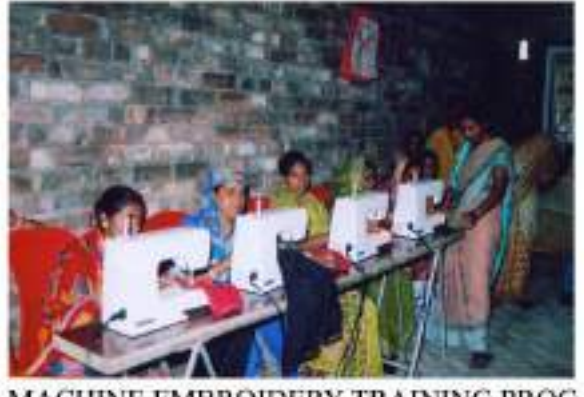
MACHINE EMBROIDERY TRAINING PROG.