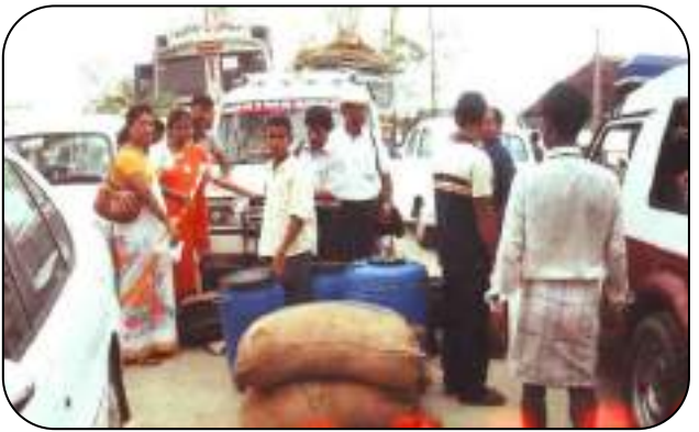
Our Post Aila Relief Work at Basanti Block