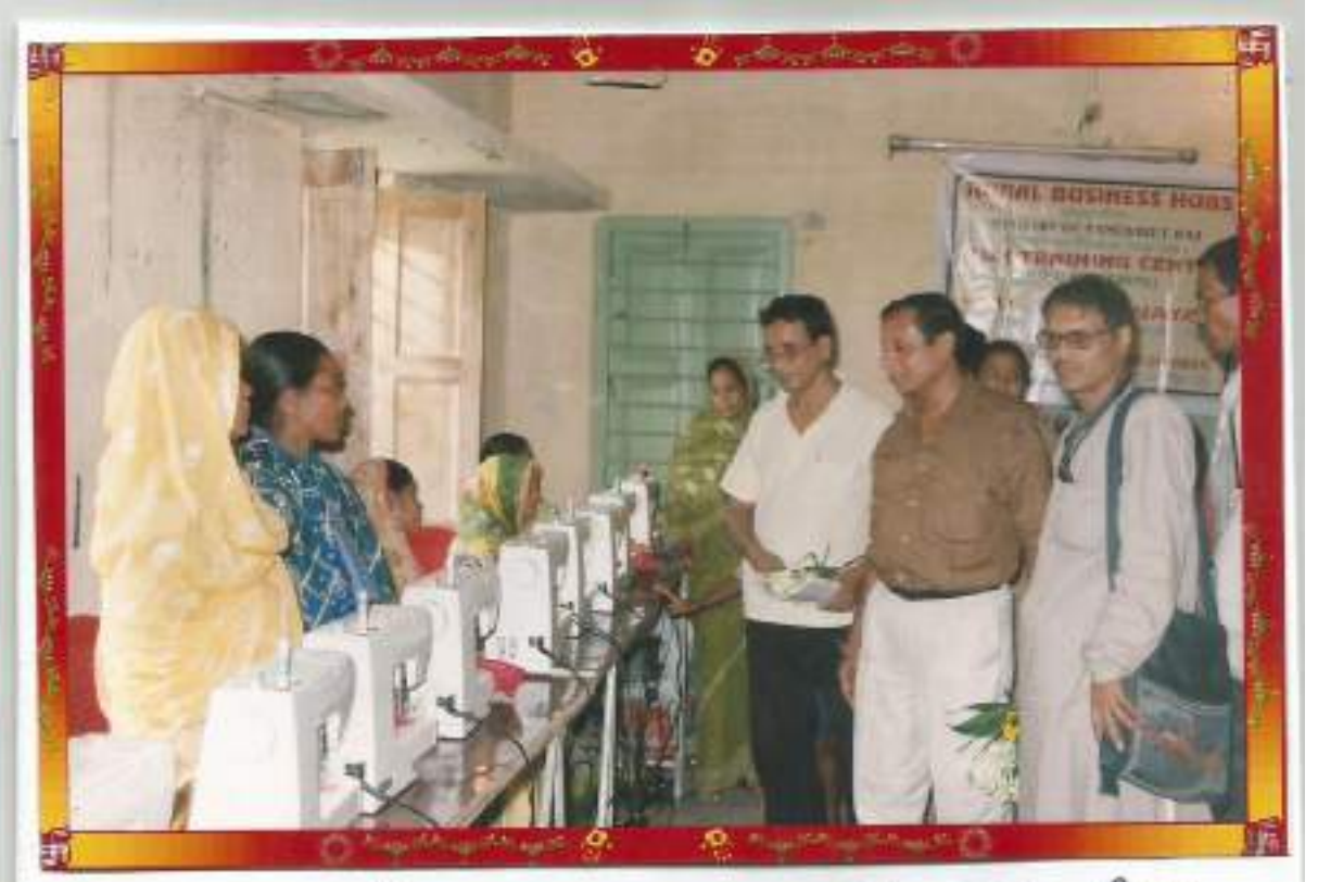
RENOWNED PERSONS VISITING OUR RBH TRAINING CENTER ON 2010