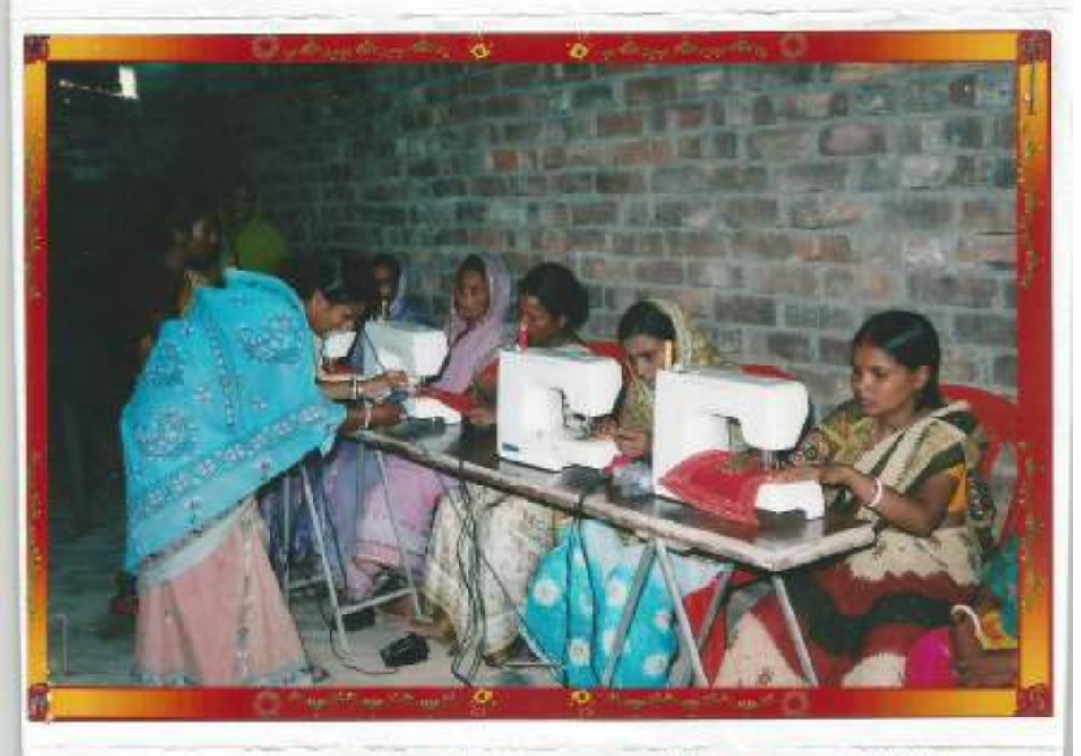
TRAINING OF MACHINE EMBROIDERY