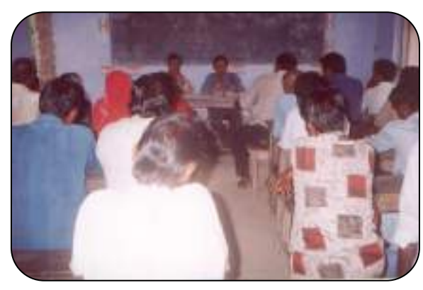
Our School & Learning Centre