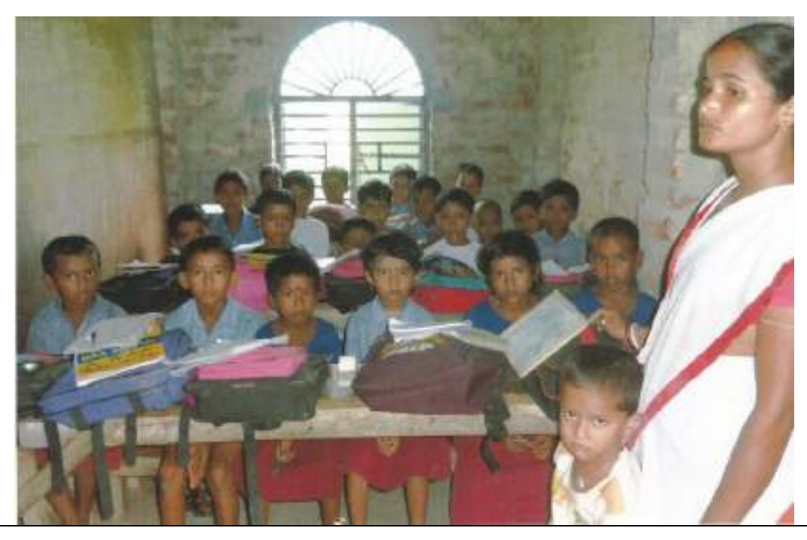
Our Running School at Purnachandrapur, Patharpratima, South 24 Pgs.