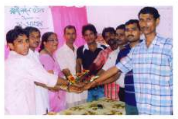
RAKSHA BANDHAN PROGRAM