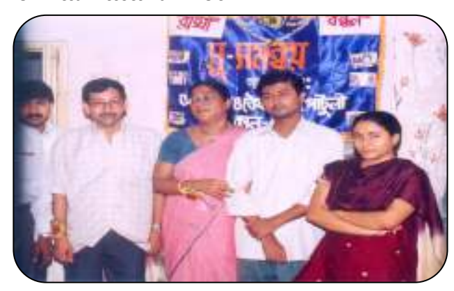
Programme of "Raksha Bandhan"