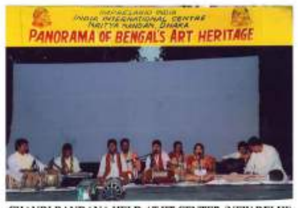
CHANDI BANDANA HELD AT IIT CENTER (NEW DELHI)